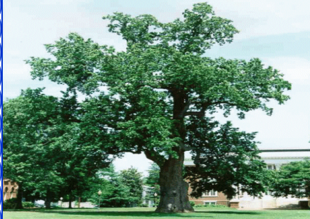
The Liberty Tree, St. John's Campus Annapolis, Md.

To all Members of Save-A-Patriot Fellowship: