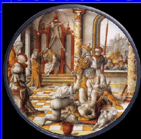
The Judgment of Cambyses 1542 AD: Grisaille and silver stain yellow on lightly tinted glass pane. Rijksmuseum, Amsterdam