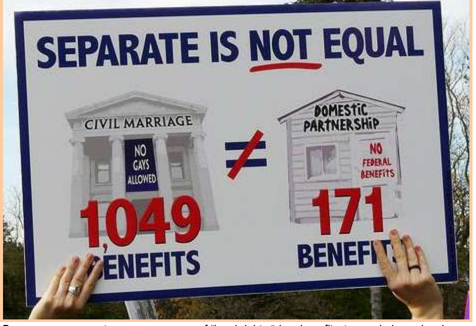
Because governments convey an array of "legal rights," i.e., benefits, to married couples, homosexuals are envious and say they are treated unfairly when denied those benefits. They understandably desire to relieve this injustice by acquiring for themselves the government-derived benefits which accompany government-sanctioned marriage.