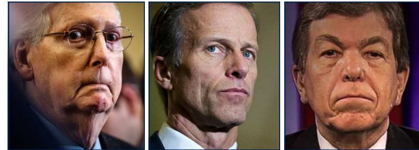
QUISLING Sens. McConnell, Thune, and Blunt — all betrayers of the Constitution and the American people — told Senate Republicans not to object to any electoral votes, because they would vote objections down and they don't want to look bad. Their allegiance is to lies, not to you.

MCCONNEL: it's a "terrible vote" for the GOP. They'd have to vote it down, which makes it seem like they are anti Trump, he said