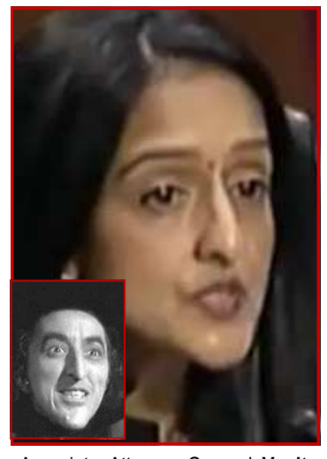
Associate Attorney General Vanita Gupta , who bears a strange and unfortunate resemblence to another (fictional) tyrant (see inset).

Following the passage of FACEA in 1994, the DOJ began immediately prosecuting protestors alleged to have used force, threats, or intimidation