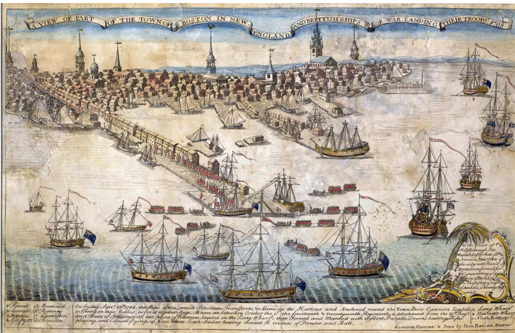
Paul Revere engraving of the arrival of British troops in Boston to enforce the Townshend Acts, 1768.

Enforcement of the English revenue laws was fairly lax, but began to become more severe in the 1760s. During this time, writs of assistance were issued by judges of the provincial courts to custom-house officers, authorizing them to search vessels and houses for smuggled goods, without identifying any particular vessel or house or goods. Under these writs, authorities