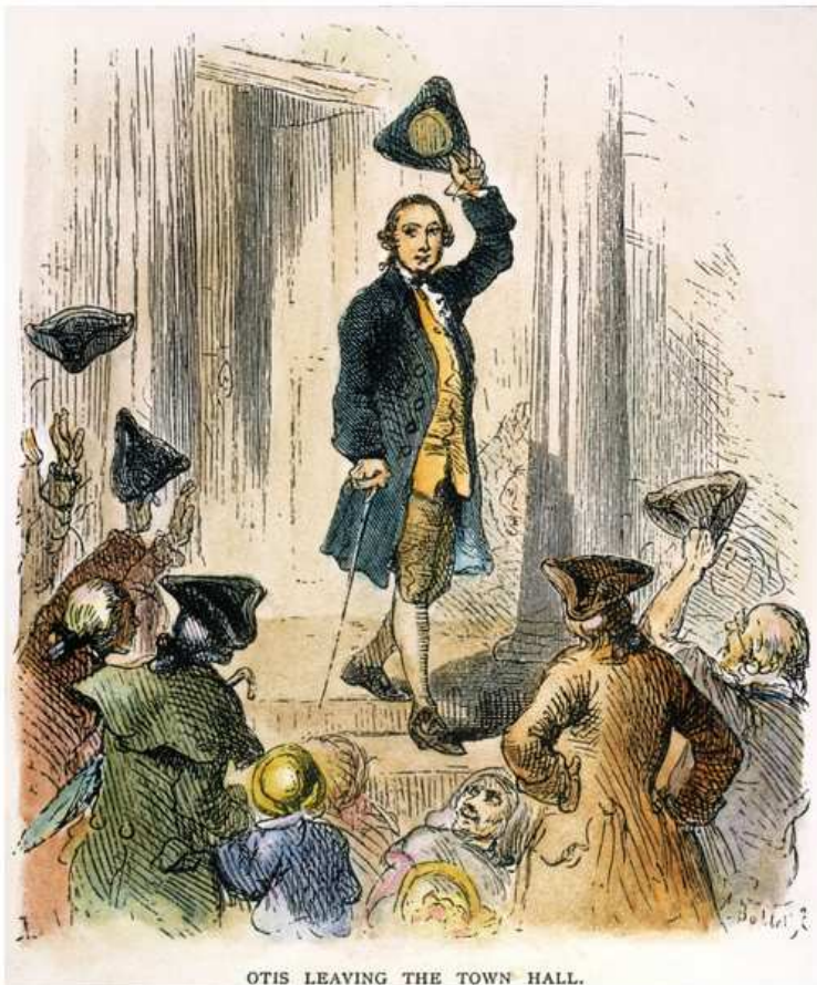
OTIS LEAVING THE TOWN HALL.

In fine the power now under consideration is the same with that given by the Law of this Province to Treasurers towards Collectors, and to them towards the subject. A Collector may when he pleases distrain my goods and Chattels, and in want of them arrest my person, and throw me instantly into Gaol. What! shall my property be