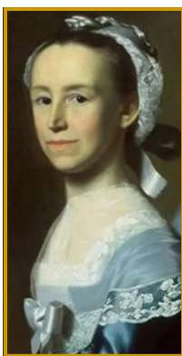
Mercy Otis Warren.

There is no provision by a bill of rights to guard against the dangerous encroachments of power in too many instances to be named: but I cannot pass over in silence the insecurity in which we are left with regard to warrants unsupported by evidence—the daring experiment of granting writs of assistance in a former arbitrary administration is not yet forgotten in the Massachusetts; nor can we be so ungrateful to the memory of the patriots who counteracted their operation, as so soon after their manly exertions to save us from such a detestable instrument of arbitrary power, to subject ourselves to the insolence of any petty revenue officer to enter our houses, search, insult, and seize at pleasure. ...[T]he rights of individuals ought to be